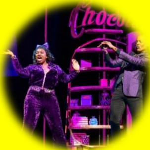
MR OR MRS BEAUREGARDE