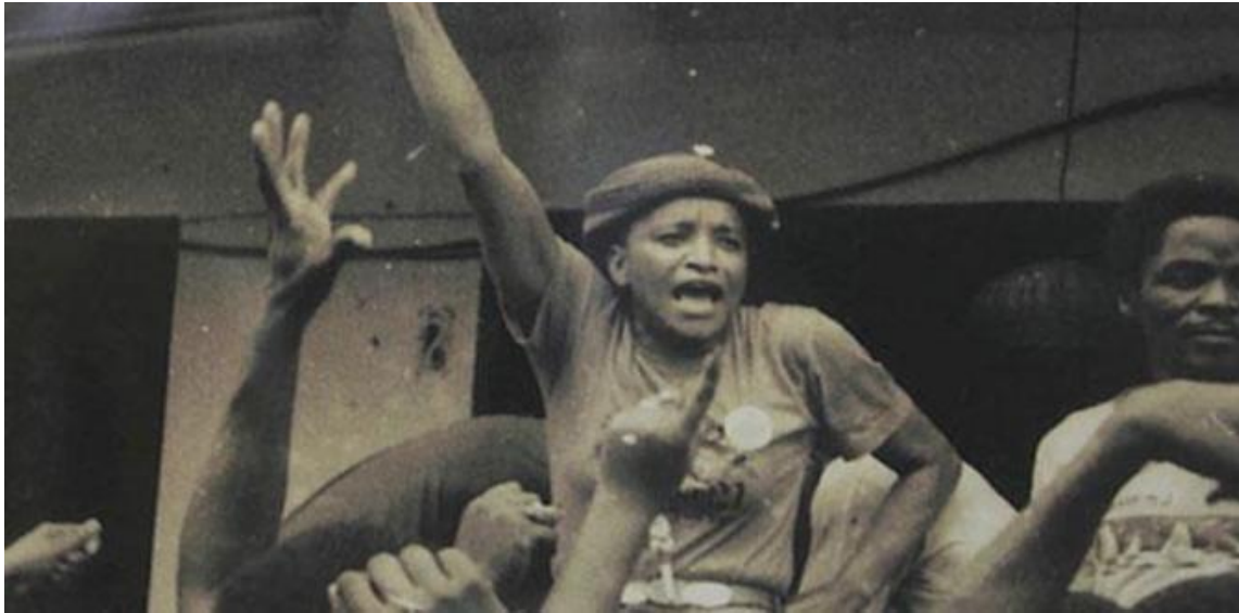
Young Ellen after she was released from prison in the 1980s. She had criticised the then military government which led to her arrest and a 10 year prison sentence but she was released a year later.

One of the few cabinet ministers from the ancien regime to live through Doe's takeover, Sirleaf even served in his government for some months before fleeing the country. She spent the remainder of the decade working in banking and finance in Kenya and the United States, except for a tilt at opposition politics in Doe's stage-managed 1985 elections that ultimately landed her in prison for seven months. Her early association with Charles Taylor was simply, she has always maintained, in the interest of removing Doe, and came before Taylor's future depredations could possibly have been foreseen. In any case, their alliance was brief. As Liberia pitched into its first civil war (1989-1996), Sirleaf was appointed UNDP's Africa chief and assistant UN Secretary-General. She stood against Taylor in the 1997 presidential elections and was defeated – unsurprising in the face of his infamous unveiled-threat-cum-campaign-slogan, "He killed my ma', he killed my pa', but I will vote for him." As the second civil war (1999-2003) beckoned, Sirleaf lived in Abidjan and established a venture-capital firm for African investors.