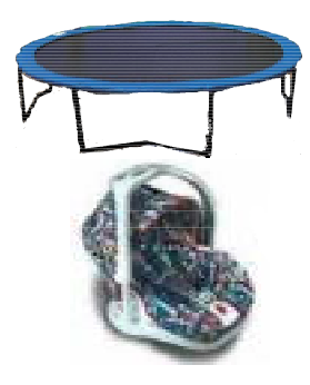
Table 6: Recalls with over 100 failures

700: Hedstrom Corp. received about 700 reports of one or more welds breaking from the trampoline frame rails during use. The reported incidents resulted in the recall of about 116,000 trampolines.