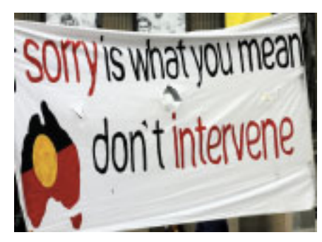
Banner at a rally calling for an end to the NT intervention, 2008.