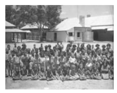
Aboriginal children at a government institution near Alice Springs, 1934.